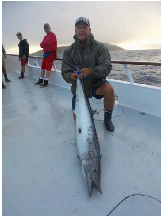
Picture of new species caught of French Rocks.